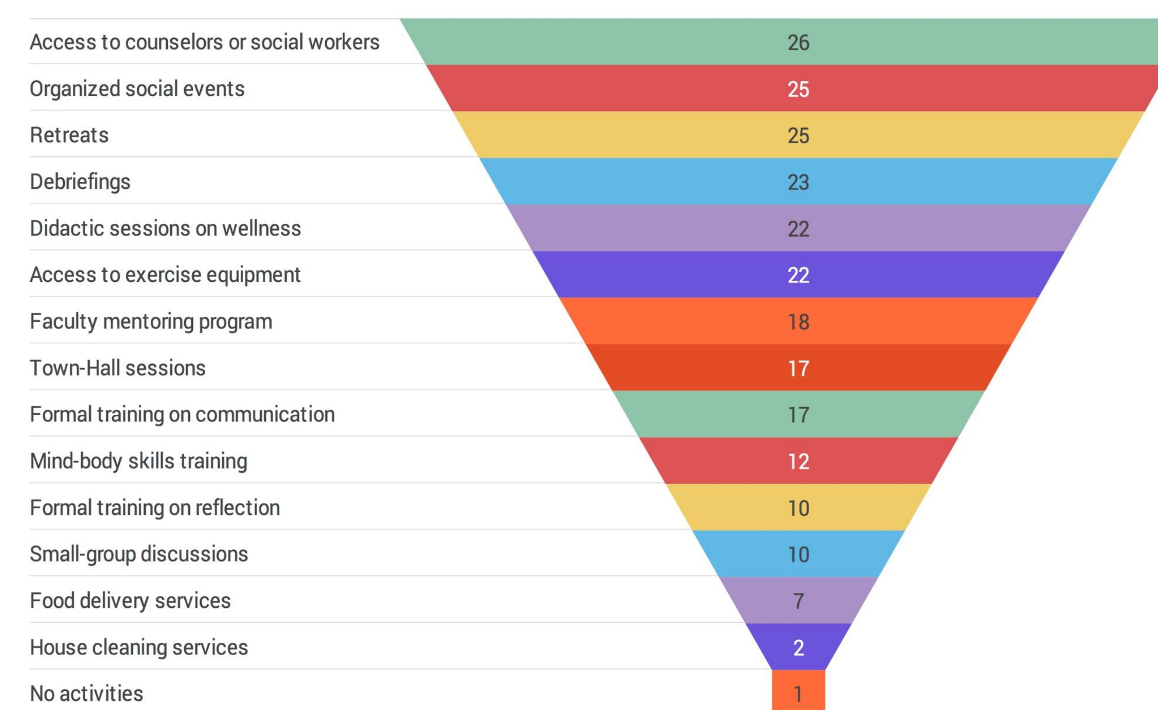
Figure 3: Programs Offered and Outcomes Monitored